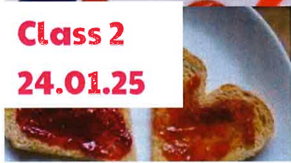
We made love-heart toast and jam.