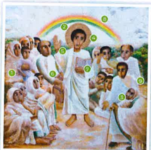
The icon portrays Jesus faithfully in the Northern Ethiopian tradition and is full of meaning: