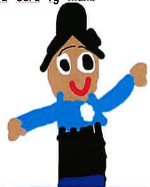
Dw i,n caru caru fy mam.

We drew pictures of people we love using Jit5. Then we wrote 'Dw i'n caru...' which means 'I love...' in Welsh.