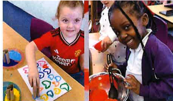
We used toilet rolls to paint love hearts.