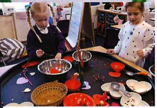
We made 'love potion' drinks.