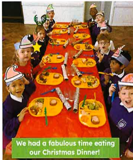
We had a fabulous time eating our Christmas Dinner!

Our Christmas dinner was delicious! We got to pull our Christmas cracker with a friend.